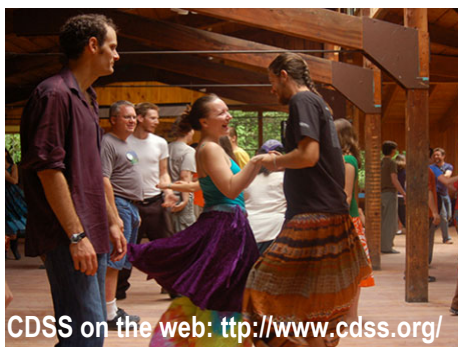
CDSS on the web: http://www.cdss.org/